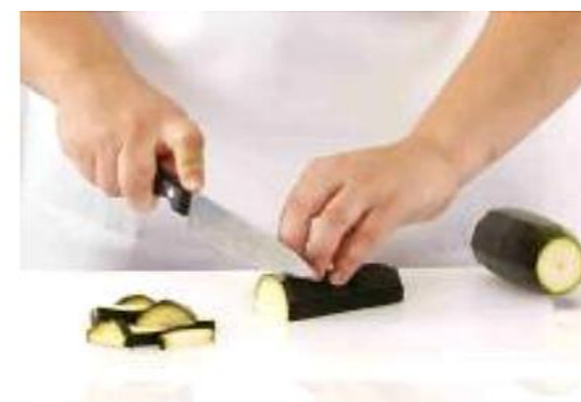
Cutting using the claw technique