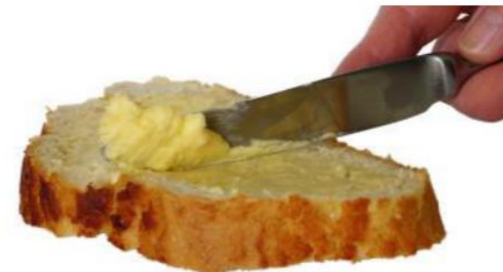
Spreading butter on bread