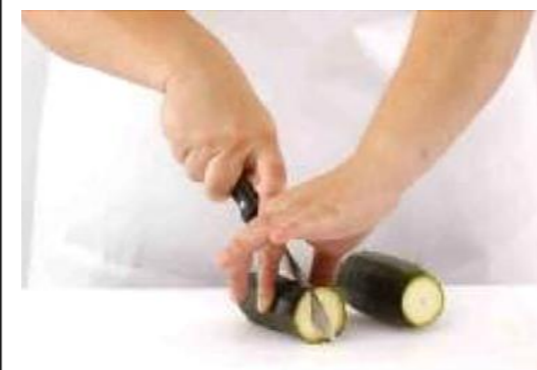
Cutting using the bridge technique