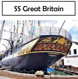
SS Great Britain