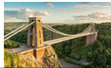
Clifton Suspension Bridge

Here are some of Isambard Kingdom Brunel's inventions: