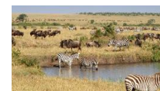
Maasai Mara National Park