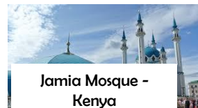
Jamia Mosque - Kenya