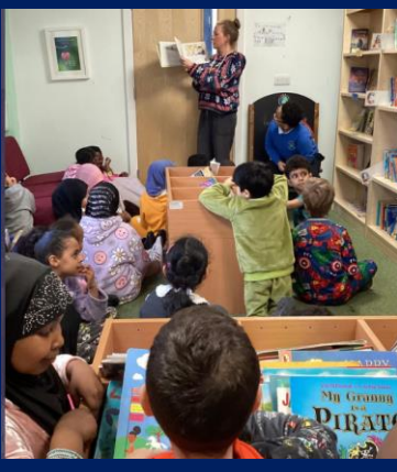
Every class visited the school library