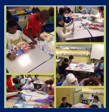
Talking about and sharing books!

We had lots of fun on World Book Day this year! Here are a few of the things we got up to: