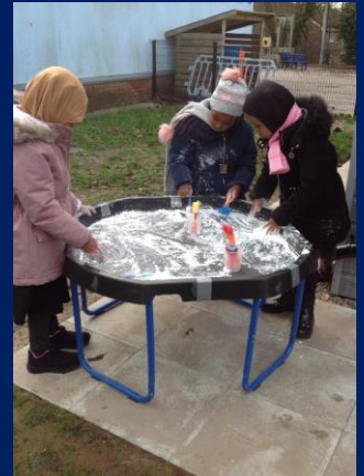
The Treehouse outdoor learning