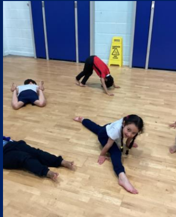
Y1 Doves PE