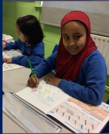
Y3 Sunflowers French